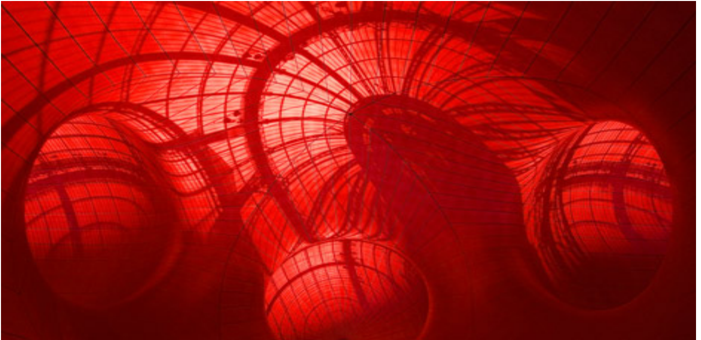
Anish Kapoor, Leviathan, Monumenta 2011, Grand Palais, Paris