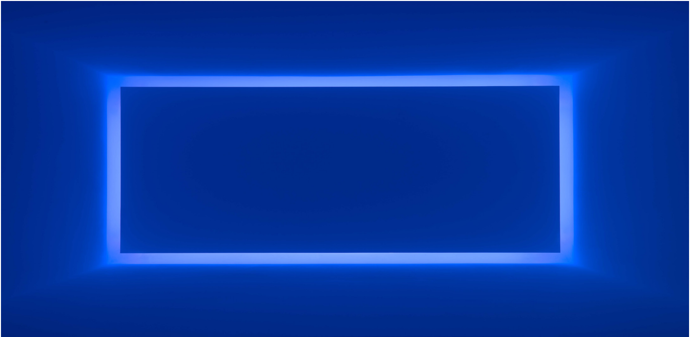
© James Turrell, 'Rondo (Blue),' from the series Shallow Spaces, 1969